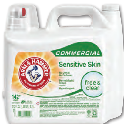
33200 00220 2/213 oz.

Specially formulated and dermatologist tested for sensitive skin. It contains Arm & Hammer™ Baking Soda, and is tough on stains yet gentle on your clothes and your skin. Special, low-sudsing formula rinses clean and is designed to work in both standard machines and today's energy conscious High Efficiency (HE) models. Free of perfume and dyes.