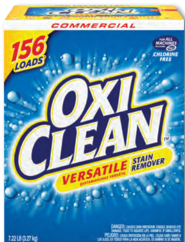
57037-00069 4/7.22 lbs.