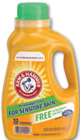
33200-00103 8/50 oz. 32 lbs.