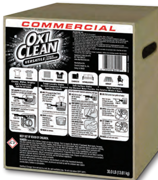
33200-84012 1/30 lbs.