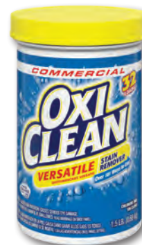
57037-01211 12/1.5 lbs.

The unique formula is activated by water, unleashing bubbling oxygen power for effective cleaning when used as directed. It boosts your laundry water pH to improve your detergent's cleaning ability, and its special ingredients are designed to help rinse soils away.