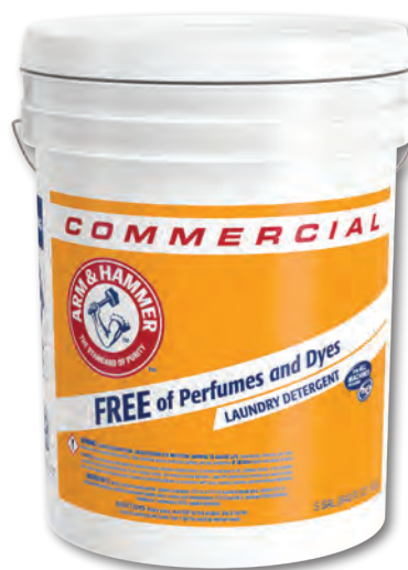
33200-00008 1/5 gallon pail